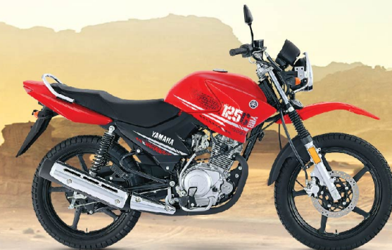
VIVID COCKTAIL RED

The design and specifications of the motorcycle shown here are subject to change without prior notice. Colors shown here may not match the actual color due to printing limitations.