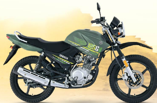
MATT DARK GRAY