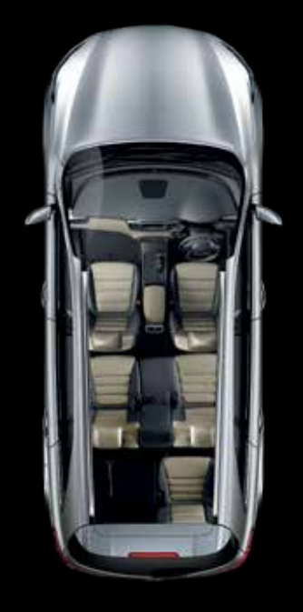
3<sup>rd</sup> row partially folded

Combining impeccable spaciousness with ultimate comfort, the new Sorento offers partial and full folding of rear seat rows, giving you multiple seating and cargo combinations to choose from. Enjoy a perfect balance of passenger comfort and practicality, including convenient loading of long or odd-shaped cargo and leisure equipment so you can travel like never before.