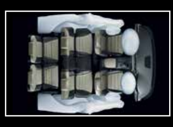
Driver + Passenger + Side + Curtain Airbags