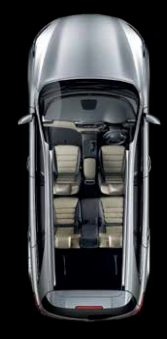
3<sup>rd</sup> row folded fully flat