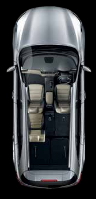
3<sup>rd</sup> row folded fully flat & 2<sup>nd</sup> row partially folded