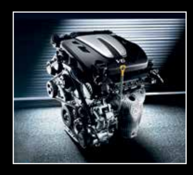
Lambda II 3.5L V6 Engine

Every Sorento is unique and power packed in its own right; but to make a more informed decision it's important to know the difference. As we move up, each variant offers unique incremental features.*