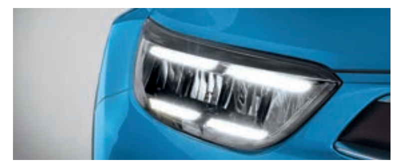
LED Daytime Running Lamps - Make your presence known during the day with the DRL of New stonic with its cutting edge design that is sure to make your lillumination, enabling you to better view the road ahead. head turn.

A striking design with stunning modern horizontal LED DRLs, iconic shape, and vibrant color options. Featuring a capability that exudes exhilaration and puts your positive vibes on full display, drive through a rainy night with absolute visibility and accuracy.