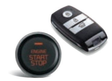
Smart Entry with Push Start: When you have the Smart key with you, start the ignition with a mere push of a button.

True style is knowing your own mind and expressing your own personality. In addition to its modern design, state-of-the-art technology and cleverly conceived features, the new Kia Stonic also comes with a wide selection of features that make it perfect for urban travel. Here are a few!