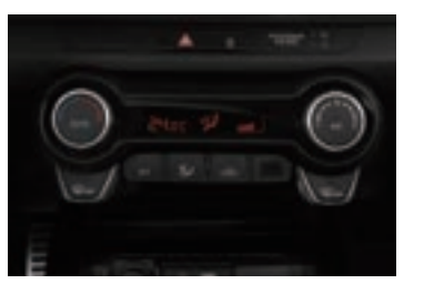
temperature for the system to maintain. A rieigni according room. digital readout displays temperature and settings.