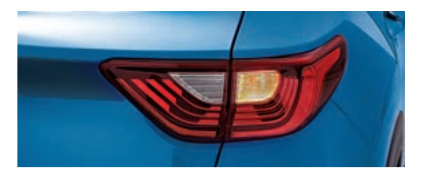
a modern, high-tech appearance.