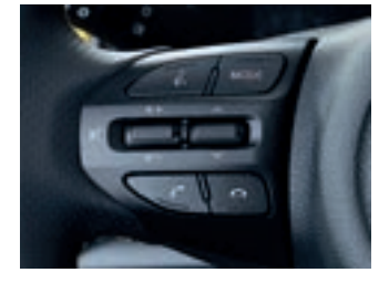
Steering Switches: Fingertip control 6 Speakers: High-quality high- Aero Blade Wipers: Aerodynamic of the sound system means you will range speakers are strategically wiper blades maintain contact with never be distracted from the road positioned for clarity and balance the windshield, even at high speeds. ahead.