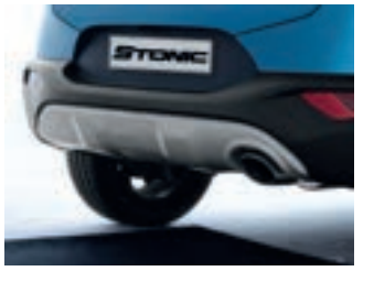
Skid Plate: An attractive, aero- Bridge-type Roof Rack: Stores bikes, Wheels: 16-Inch Alloy Wheel dynamically contoured skid plate below luggage or bulky sporting goods the rear bumper helps protect the body securely on the roof to preserve interior and fuel tank from scrapes.