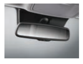
retaining a clear view of other objects. designed to alert you of a change in driving clarity at all times.