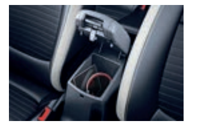
Metal Pedals: Add an authentically sporty Sun Visor Illumination Lamps: Tasteful Cup Holder: 6 cup holders help you easily Overhead Console Lamp with Sunglass Center Console Armrest: The comfortable look and feel to the interior with stainless LEDs beside the vanity mirror on the store your coffee or bottle on the go with Case: An overhead console helps you stay armrest is coordinated with interior trim and organized and keeps your sunglasses high integrated with a console that includes two