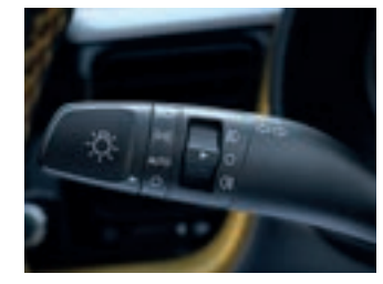
Electro-Chromic Mirror: The electroTire Pressure Monitoring System Auto Defogger: A sophisticated sensor Auto Light Control: The headlamps Electric Folding Mirrors with Side High Mounted Stop Lamp (HMSL): most intense light sources in the mirror. System (TPMS) in your Stonic is and clears it automatically, giving you external light and adjust to its levels for