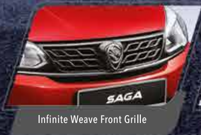
Infinite Weave Front Grille