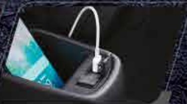
3 USB Ports***