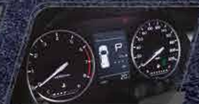
Meter Combination with Multi-Information Display