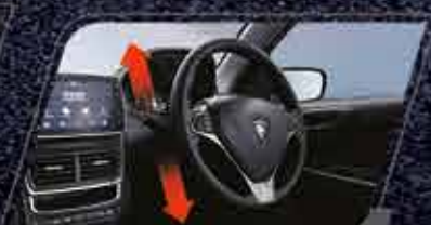
Steering Tilt Adjustment