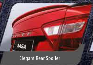
Elegant Rear Spoiler