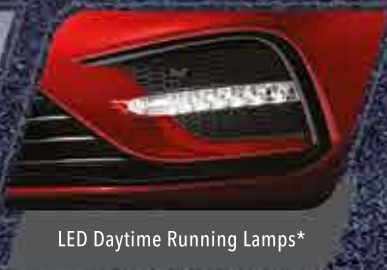
LED Daytime Running Lamps*