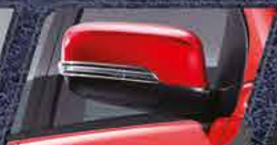
Electric Door Mirrors with LED Turn Signal Lamps