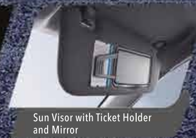
Sun Visor with Ticket Holder and Mirror