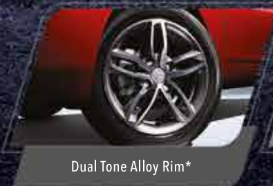
Dual Tone Alloy Rim*