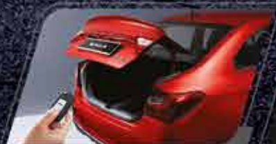
Remote Trunk Release