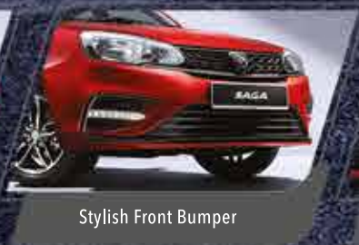
Stylish Front Bumper