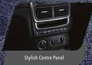
Stylish Centre Panel