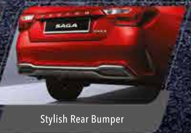
Stylish Rear Bumper