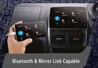
Bluetooth & Mirror Link Capable