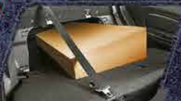
Bench Type Rear Seat Fold