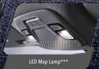
LED Map Lamp***