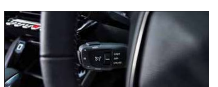
Cruise Control with Speed Limiter