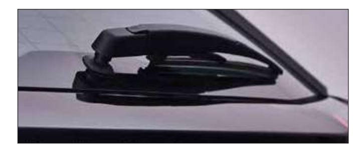
Intermittent Wipers with Rain Sensors