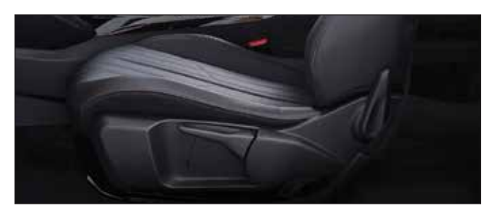
Height Adjuster (Driver & Passenger Side)