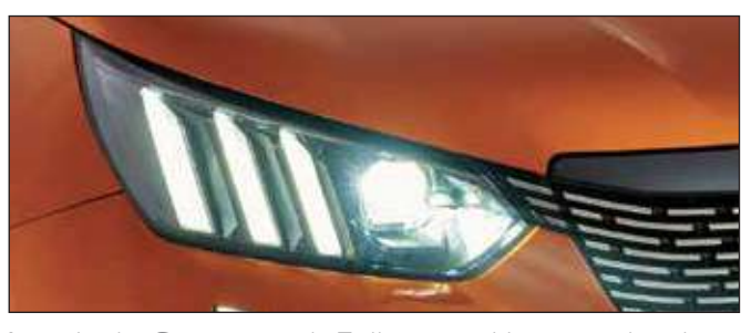
Auto Light System with Follow-me-Home technology