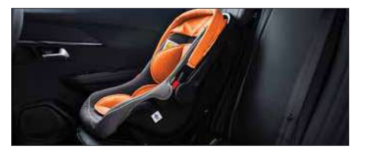
ISOFIX Child Seat Anchors