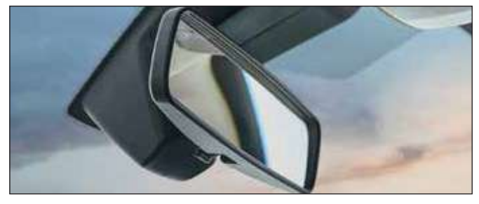
Manual Dimming Interior Rear View Mirror