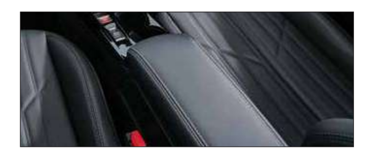
Front Central Armrest with Storage