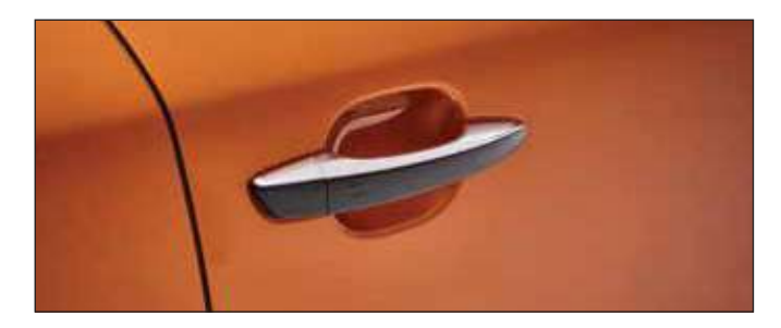
Black Chromed Door Handles