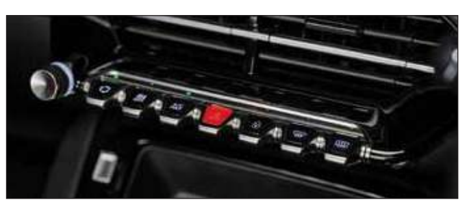
Piano Toggle Switches