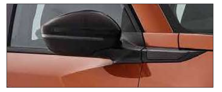
Heated & Electric Foldable Mirrors with Piano Black Shell