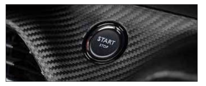
Smart Entry & Push Start