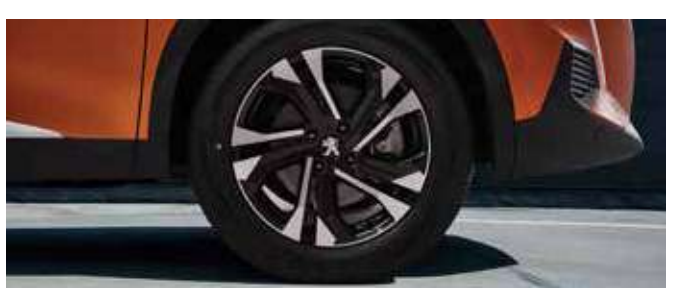
17" Diamond Alloy Wheels