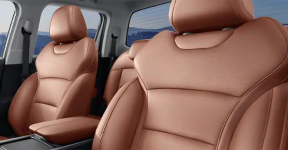
VENTILATED SEATS WITH LEATHER UPHOLSTERY