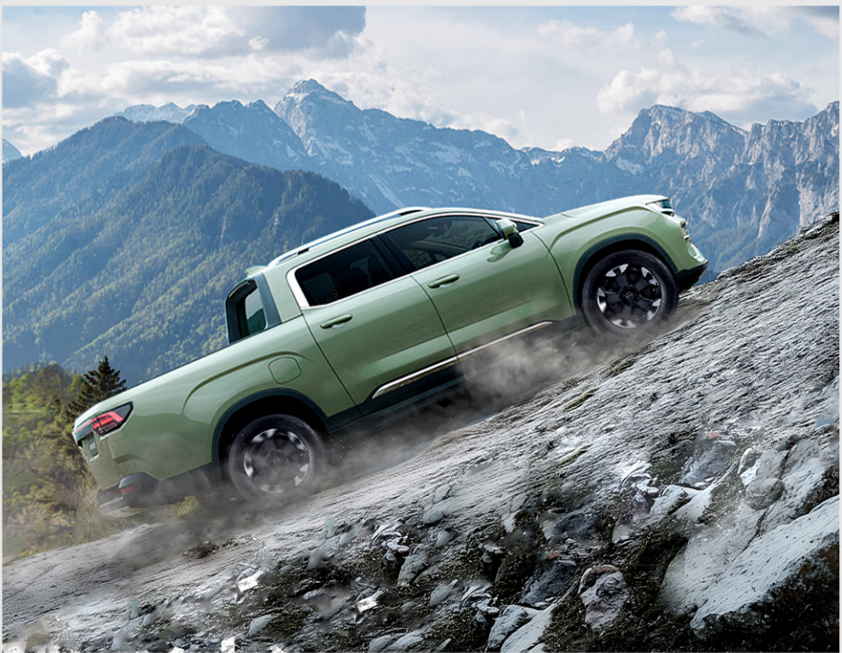
45° INCLINE CAPABILITY