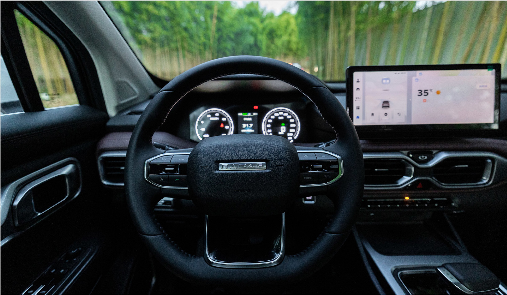
UP TO 14.6-INCH INFOTAINMENT + 10.2-INCH DRIVER DISPLAY