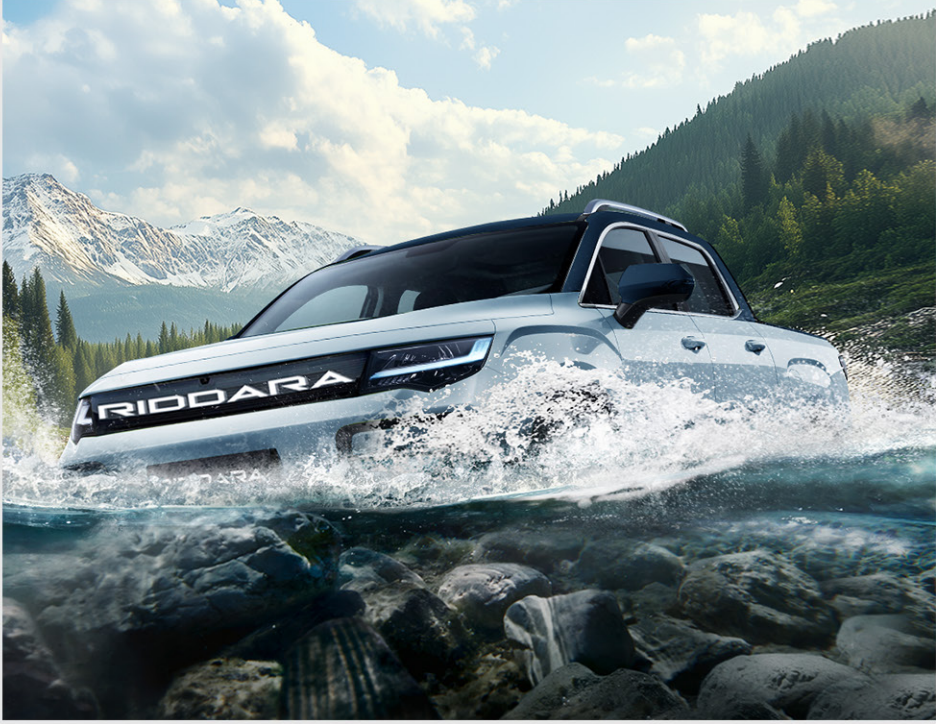
815MM WATER WADING