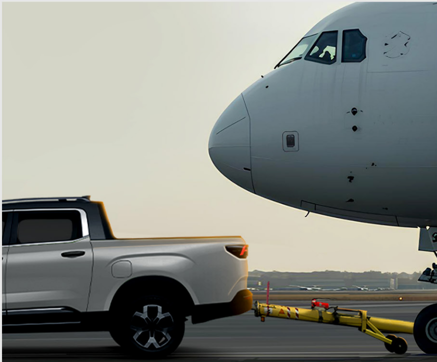
3000 KG TOWING LOAD