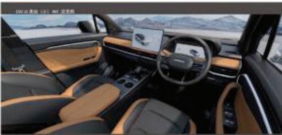
Black Brown Interior (only for 73kwh 2WD)