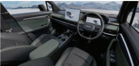
Dark Green Leather (Only applicable to Green exterior only)