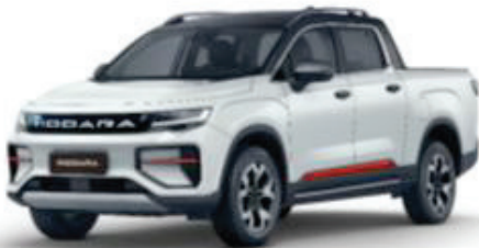
RD6 73kwh Pro 4WD | RD6 Ultra 86kwh 4WD