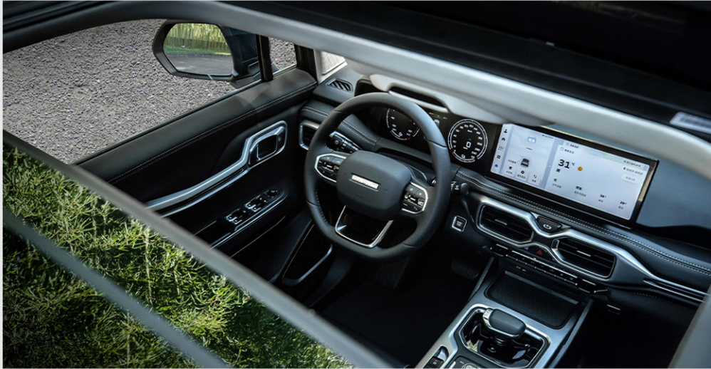
PANORAMIC ELECTRIC SUNROOF