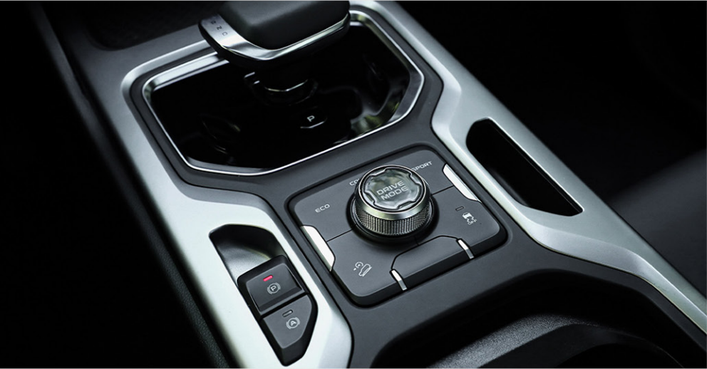
7 DRIVING MODES