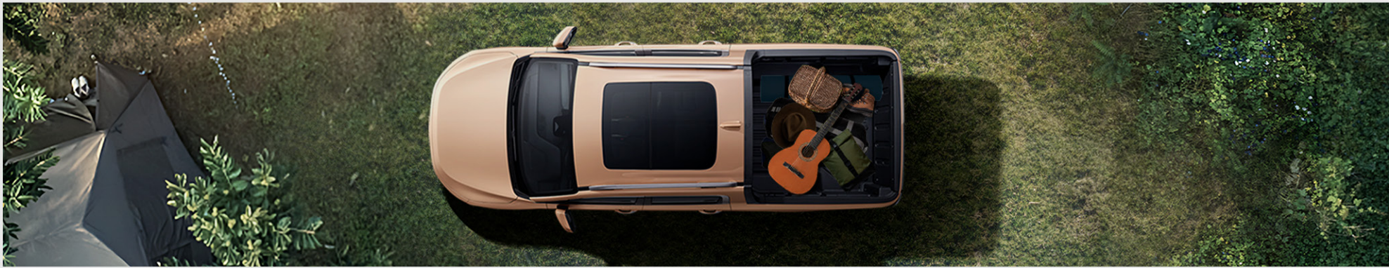
1030 KG LOADING CAPACITY