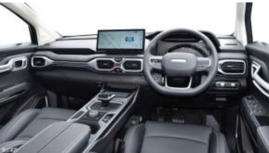
Black Interior (only for 63kwh 2WD)