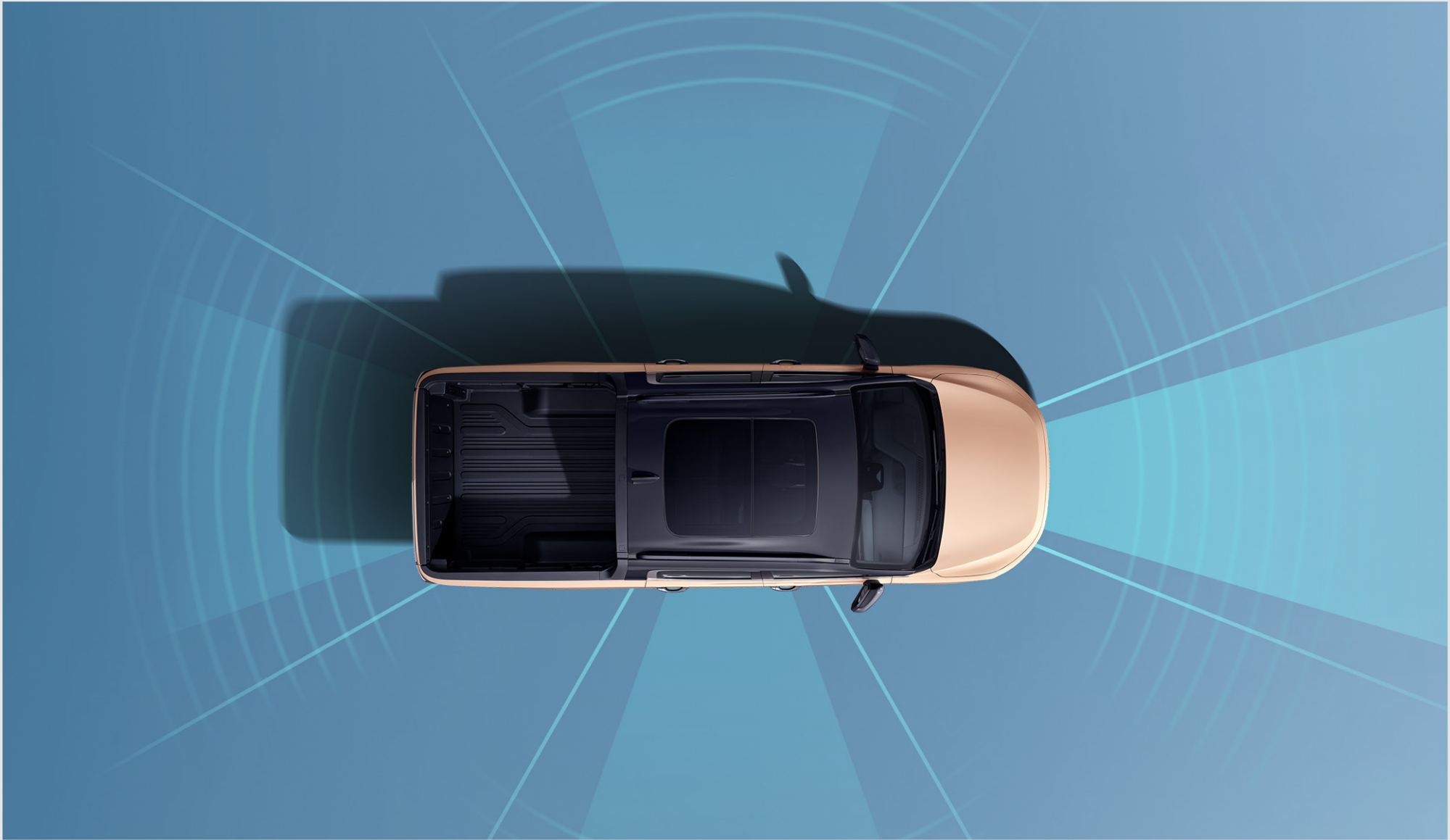
L2+ INTELLIGENT DRIVING SYSTEM