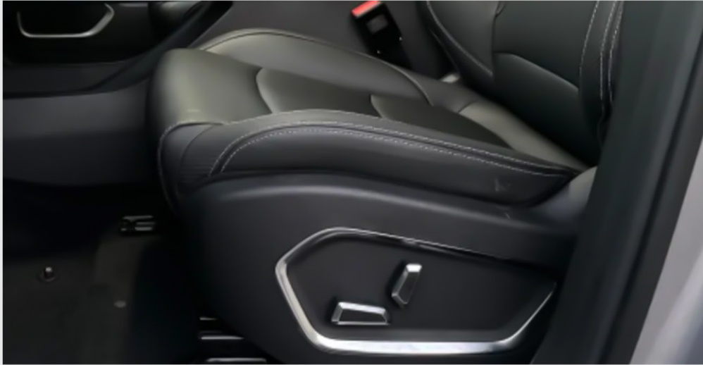
6-WAY POWER ADJUSTABLE FRONT SEATS