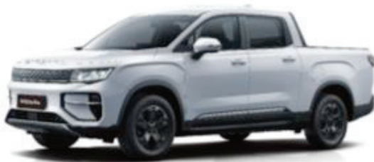
RD6 73kwh Air 2WD